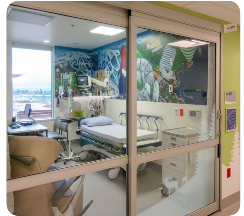
Oncology Outpatient Clinic Room

With the exception of the fifth and ninth floors (which are mechanical floors), all of the floors are designated patient care areas. Every patient room in the Teck ACC has a window with access to natural light and is designed to be a single patient room. Within each room there is a provider zone upon entering the room, a patient zone in the middle of the room — where the patient's bed is located, and a family zone towards the