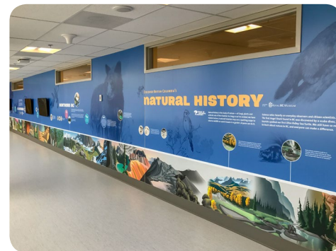
Hallway Connecting Oncology Inpatient and Outpatient Areas

Since our Oncology/Hematology/BMT patients and NICU patients are the most immunocompromised, they were the first