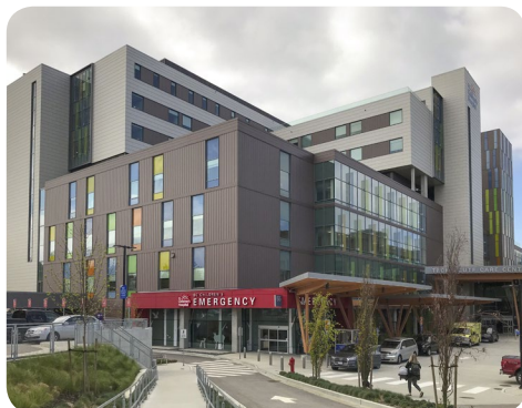
BC Children's Teck Acute Care Centre