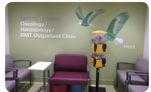
Entrance to Outpatient Clinic

The eighth floor is home to our Oncology/Hematology/BMT program including both the inpatient unit and outpatient clinic; this is a big change as we previously spanned three floors! The air is HEPA filtered for better infection control for our immunocompromised patient population. Both areas have experienced some big changes. The inpatient unit has increased to two wings with 27 rooms (up from 24 rooms on two floors). We now have seven positive-pressure rooms to accommodate our BMT's and one lead-lined room for future MIBG therapy.