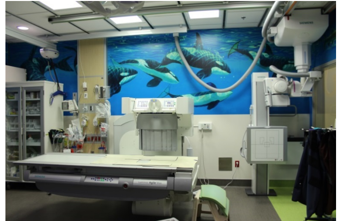
The VCUG x-ray room