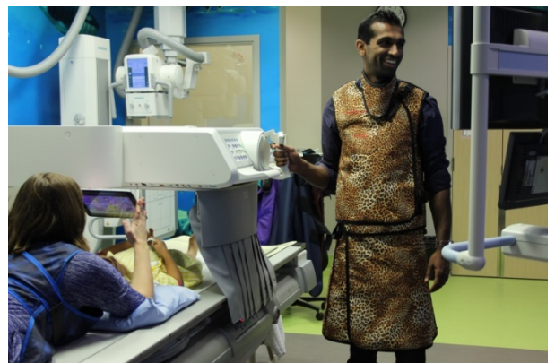
The radiologist and a patient ready for her VCUG