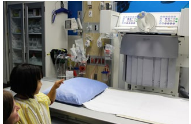
Pointing at the VCUG x-ray camera